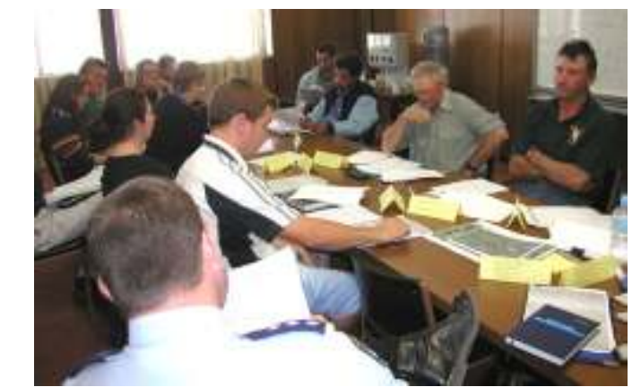
Walgett's only youth activity. Above: In May 2006 the DEG and the Youth Subcommittee took a key role in negotiations regarding the use of the Walgett Swimming Pool. The need for a pool Management Plan came about because the Walgett Swimming Club was requiring exclusive access to the pool (a community resource located in a Public Recreation Reserve) during the summer on a Friday night despite the youth centre being closed at the time.