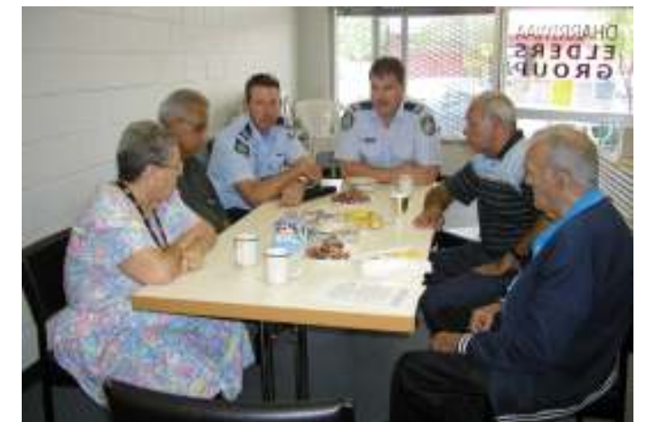
Right: Representatives of the PCYC Foundation met with DEG in March 2006 to announce a new mobile PCYC service for Walgett youth four days a month. The Youth Subcommittee takes credit for attracting the PCYC to Walgett and will support the organisation by co-ordinating volunteers and providing advisory services.