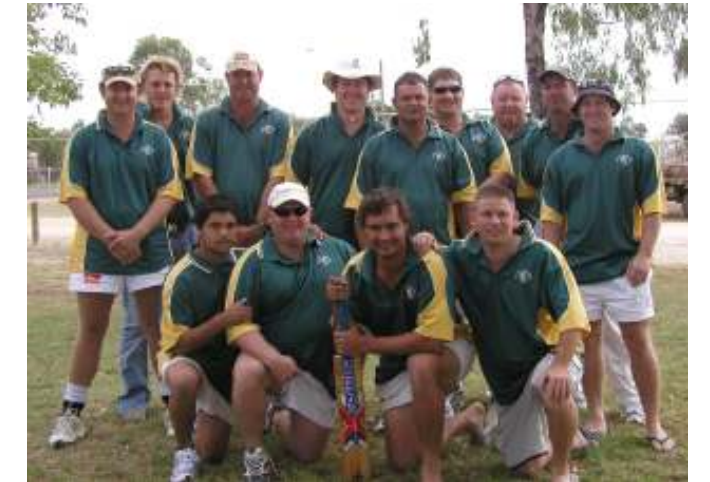
year by Dharriwaa Elders Group members on her football committee. Above right: The Walgett "Breakaways" cricket team which won the cricket final in March scored 140 and beat the Collie "Cods" with 105 runs.