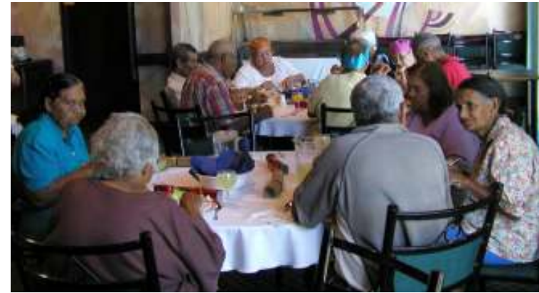
A Christmas lunch was held for members in mid December at the Walgett Sporting Club. Goodwill cheer was shared by all as we remembered the year that was almost over, and started planning for the year ahead.